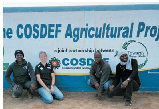
Garden Training (part 1) - June

Four staff members were recognised during our 20 year staff celebration for their hard work and long-service to NaDEET .