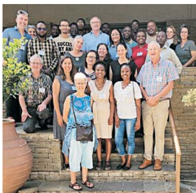
Fundraising Workshop - March