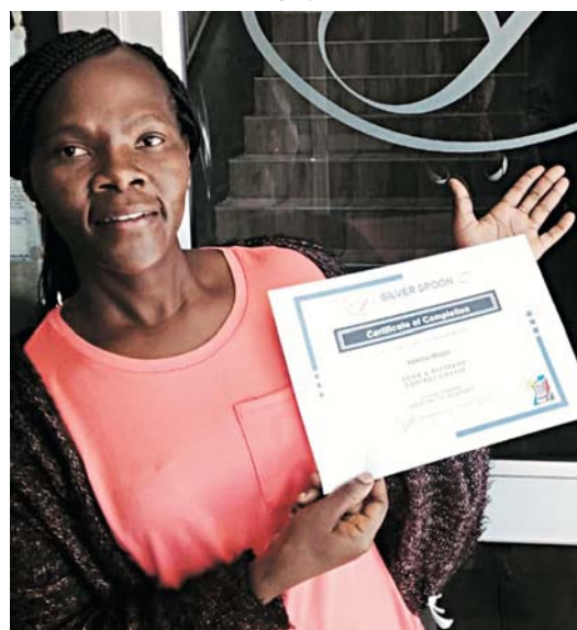
Food & Beverage Training - February