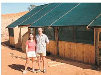
The NaDEET Team in 2003