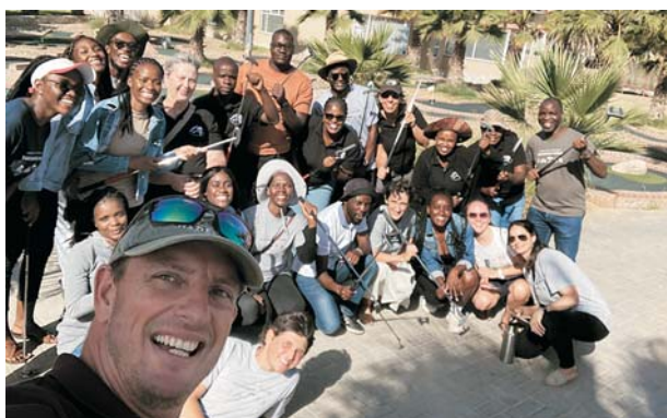
Staff Team Building Workshop - January