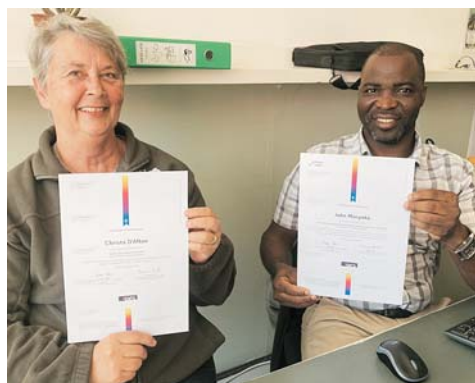
Professional Short Courses - Yearlong